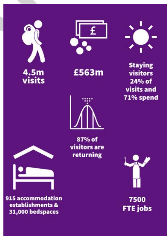
Figure 1: The English Riviera Visitor Economy 2019

Covid-19 has undeniably had a devastating impact on the resort. Despite this, the sector has remained resilient with positive results from summer 2021 and achieving accolades such as TripAdvisor's 2021 Number 1 Staycation Destination. There has also been continued investment in products and businesses across the destination.